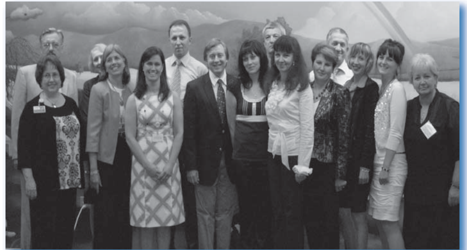
Ukrainian Delegates pose for a photo with members of the HPCG staff.

On Wednesday, May 12, 2010, HPCG was pleased to host a delegation of medical professionals from the Ukraine interested in establishing a hospice program in their own country. The healthcare professionals, including physicians, nurses and healthcare leaders, studied the U.S. hospice movement and hospice program development for a few weeks in North Carolina.